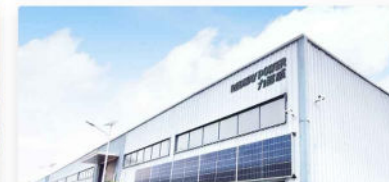
Production Base 2 (Factory 2)

Building 2, 78 Puxing East Road, Qingxi Town, Dongguan