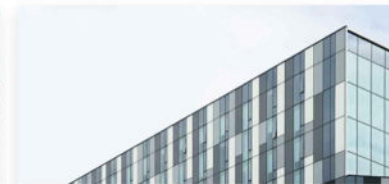
Redway Power Group (HK) Limited

Building B, Huanzhi Center, Longhua District, Shenzhen