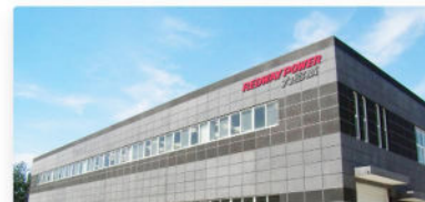
Production Base 1 (Factory 1)

RM 21 UNIT A 11/F TIN WUI IND BLDG NO 3 HING WONG ST TUEN MUN NT, HONG KONG