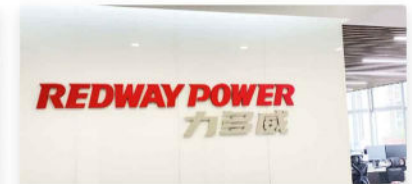
Hong Kong Rayworld Industrial Co., Limited

FLAT/RM 7022 BLK D 7/F TAK WING INDUSTRY BLDG, 3 TSUN WEN ROAD TUEN MUN NT, HONG KONG