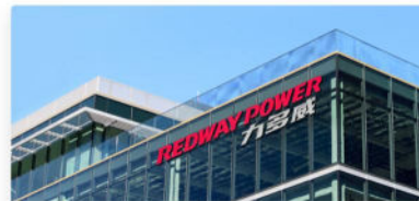
Shenzhen Redway Power, Inc

Building B, Huanzhi Center, Longhua District, Shenzhen